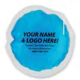
4" Round with cloth back