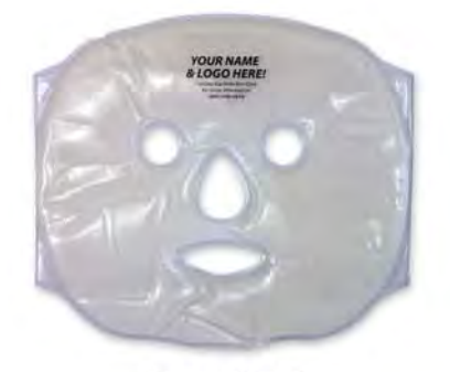
Face Mask Features ultra soft cloth back and adjustable straps